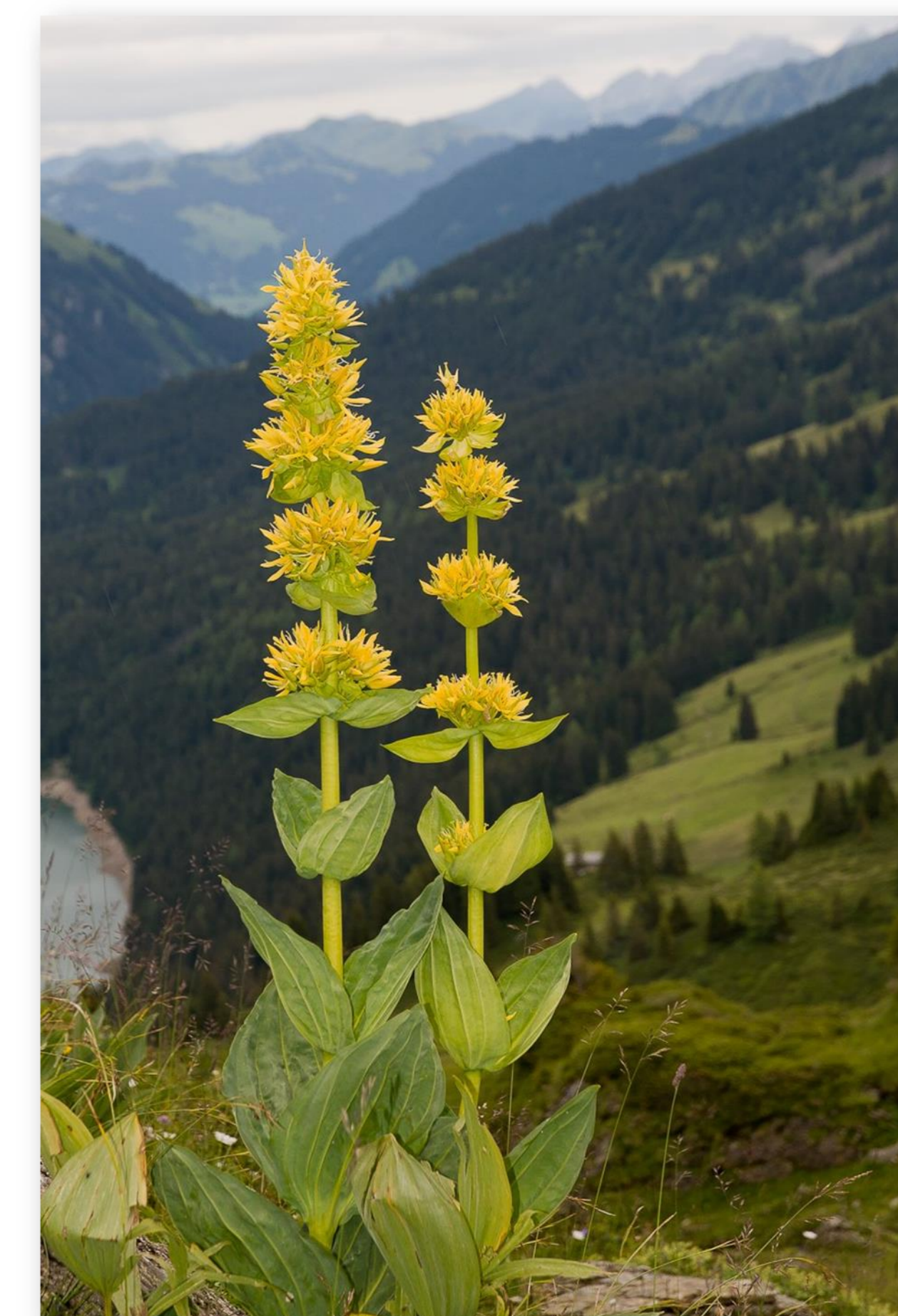
Gentiana lutea L., Gentianaceae

Gentian root extracts were prepared in five replications under the optimal conditions by UAE and by HAE according to the previously reported results by Živković et al. (2019) and Mudrić et al., (2020).