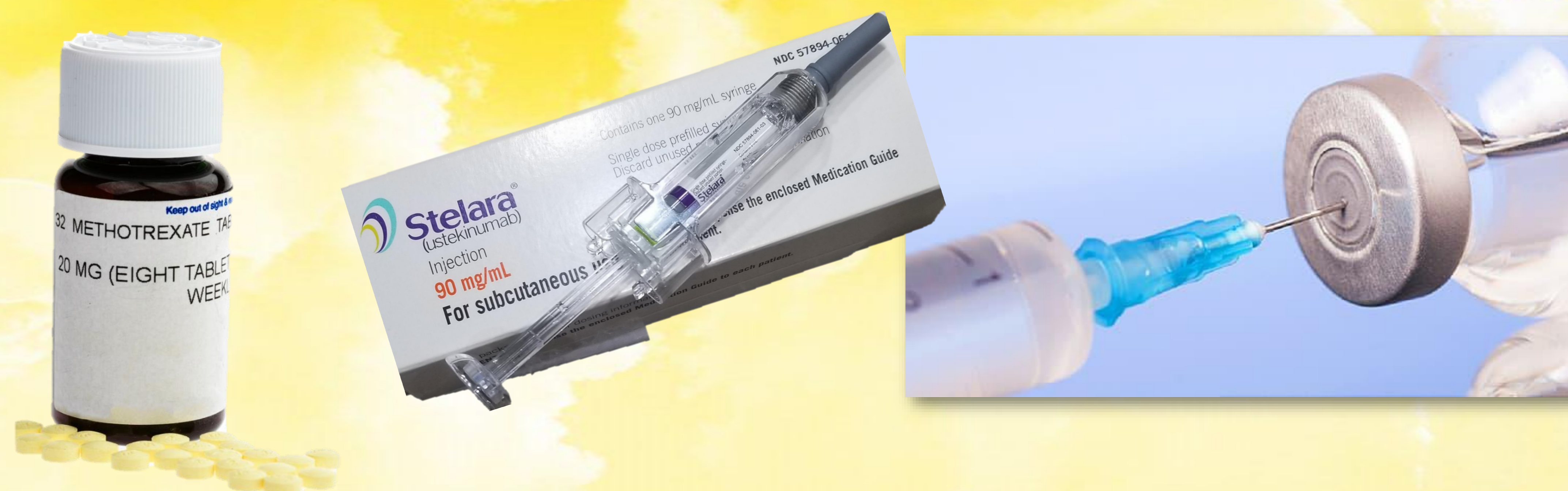
Figure 2. Treatment of psoriasis with biologic drugs