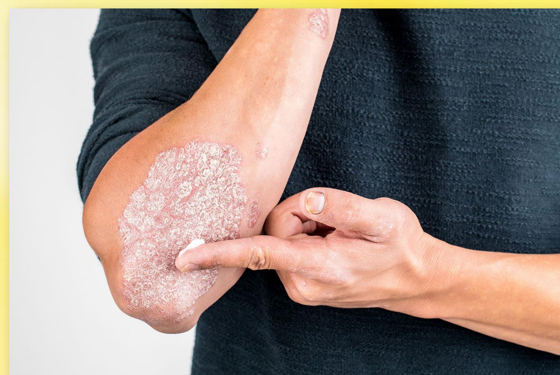
Figure 1. Treatment of psoriasis with systemic drugs

Psoriasis is a chronic skin disease (Fig. 1) that affects between 0.91 and 8.5 % of people across the world. Of these, approximately 10% suffer from different severe forms. Therapeutic drugs in treating moderate to severe psoriasis have been limited. Three of the so-called "non-biological systemic therapies" were the most commonly prescribed systemic drugs (Fig. 1) worldwide: Methotrexate (methotrexate), Neotigason (acitretin), and Sandimmun Neoral (cyclosporine). Clinical trials for systemic medicines have shown high rates of severe infections in psoriasis. Still, these have not been confirmed in all trials because of the lack of statistical power to demonstrate differences from placebo. Biological drugs (Fig. 2) which have been authorized for use in severe and moderate forms of psoriasis are: Stelara (ustekinumab), Humira (adalimumab), and Cosentyx (secukinumab). A recent systematic review stated that there was still insufficient evidence about the risk of severe infections from biological drugs in psoriasis patients in long-term and daily use and that further observational studies were needed [1]. It is confirmed that a large number of people in Serbia have severe psoriasis.