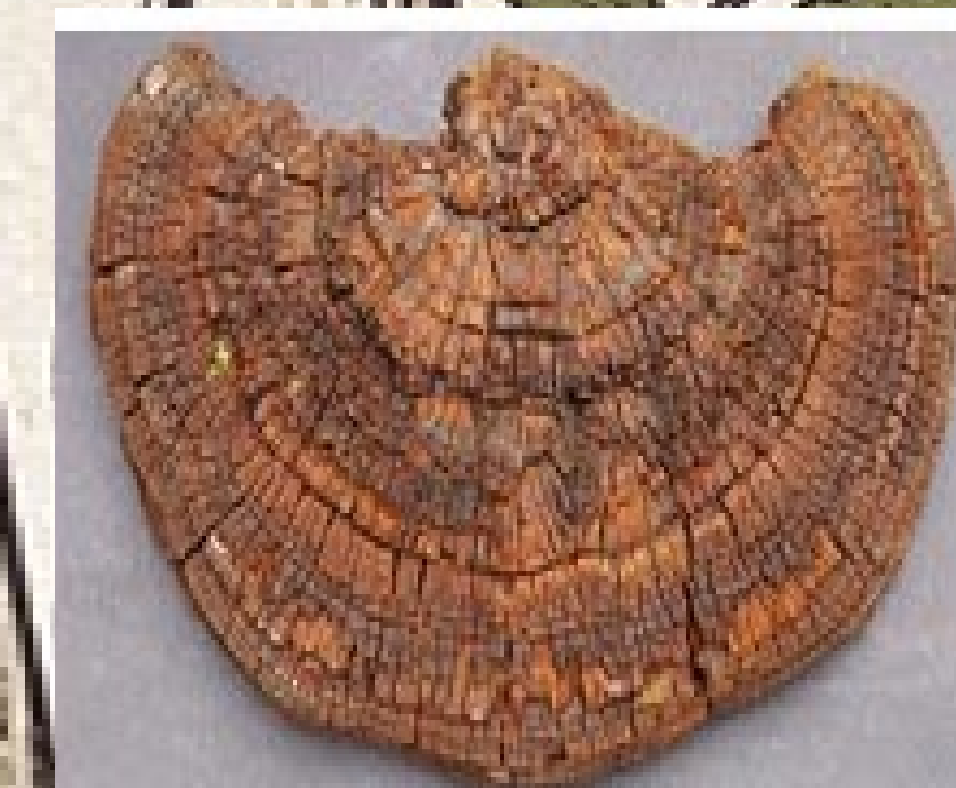
Figure 1. Phellinus linteus (Berk. et Curt.) Teng

Dried hot water extract of wild type P. linteus was kindly provided by Amazing Grace Health Industries (Bangkok, Thailand). FT-IR was used to study the polysaccharide profile of the extract. Its antioxidant potential was measured by the conjugated diene method in the linoleic acid model system. Immunomodulation was tested in vitro by measuring the synthesis of interferon-gamma (IFN- \gamma ) in healthy human peripheral blood mononuclear cells (PBMCs) using enzyme linked immunosorbent assay (ELISA).